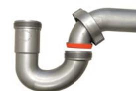
b. Pre-assembled P-Trap and outlet tube with washer