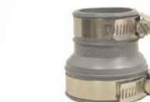
d. Wall drain coupling *Coupling not included in UPC certification