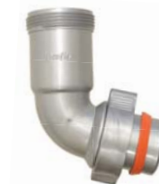
c. Regular elbow & Elbow with dishwasher or R/O drain branch