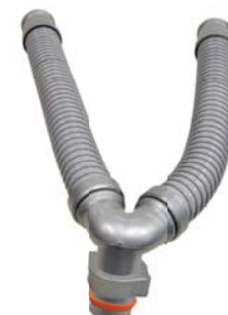
a. "Y" flexible hose section

Please read through all the instructions before beginning the installation.