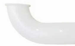
i. Tailpiece-elbow (2)

Tools needed: ruler, measuring tape May require: adjustable pliers, flat screwdriver